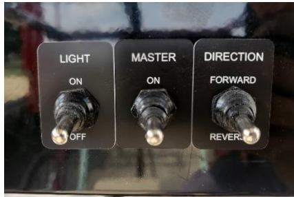
Control switches for light port, master, and direction. (LED light is not included in base model)