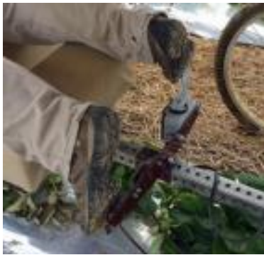
Foot pedal (speed control) | steering pedals (right and left)